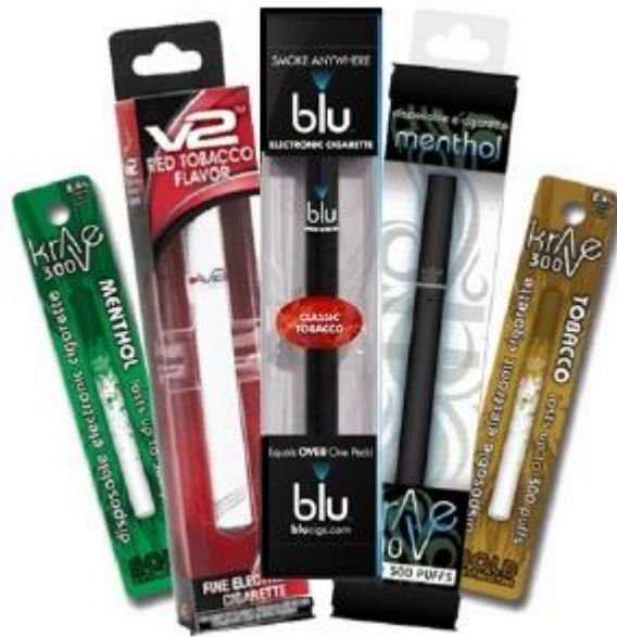
Figure A2.2 Example Image – e-cigarettes

Electronic cigarettes, also known as e-cigarettes, e-vaporizers, or electronic nicotine delivery systems, are battery-operated devices that people use to inhale an aerosol, which typically contains nicotine (though not always), flavorings, and other chemicals. Here are some examples of e-cigarettes: