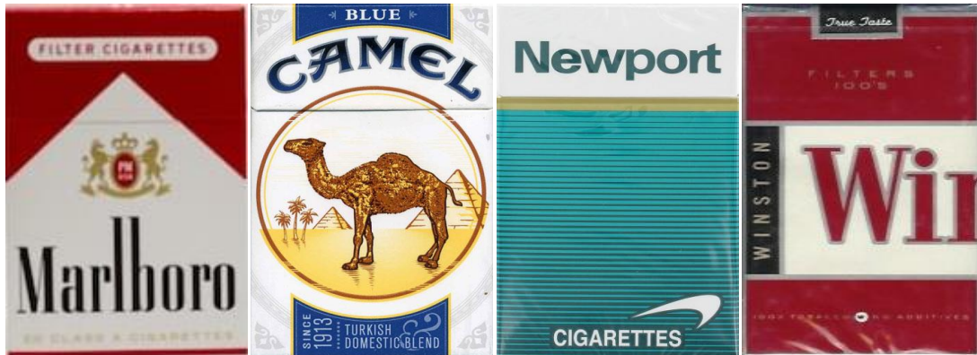
Figure A2.1 Example Image – Traditional Cigarettes

A cigarette is a narrow cylinder of finely cut tobacco leaves that are rolled into thin paper for smoking. The cigarette is ignited at one end, causing the cigarette to smolder and allowing smoke to be inhaled from the other end. Most modern manufactured cigarettes are filtered. Here are some examples of traditional cigarettes: