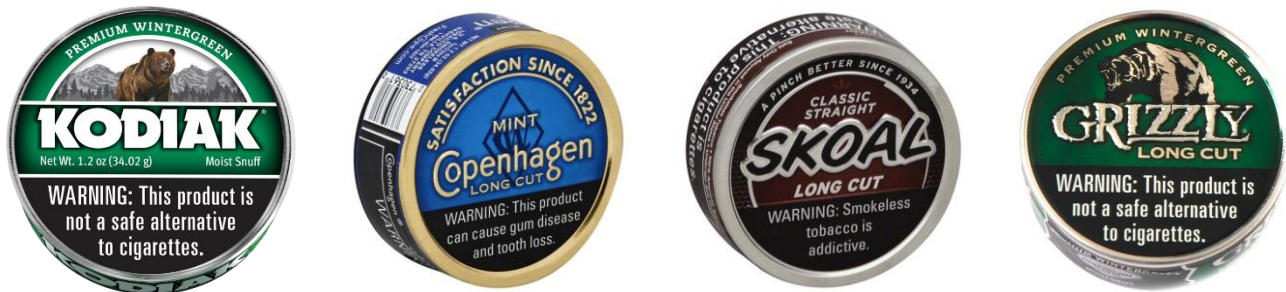
Figure A2.3 Example Image – Moist Snuff

Moist snuff is a smokeless tobacco product that is consumed by placing it into your mouth between the lip and the gum. You don't burn it, and users often spit when they use it. Here are some examples of moist snuff: