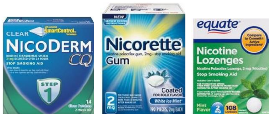
Figure A2.4 Example Image – Nicotine Replacement Therapy Products

Nicotine Replacement Therapy are products that contain nicotine but no tobacco and are used to help people quit cigarettes or other tobacco products. Nicotine Replacement Therapy products usually come in the form of gum, patches, inhalers, lozenges or tablets. Here are some examples of NRTs: